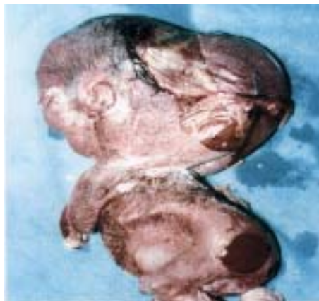
Iraqi Baby Deformed thanks to the US-UK depleted uranium

The following photos are reminders of the US-UK murderous legacy of perpetual death experienced in Iraq but now in Afghanistan